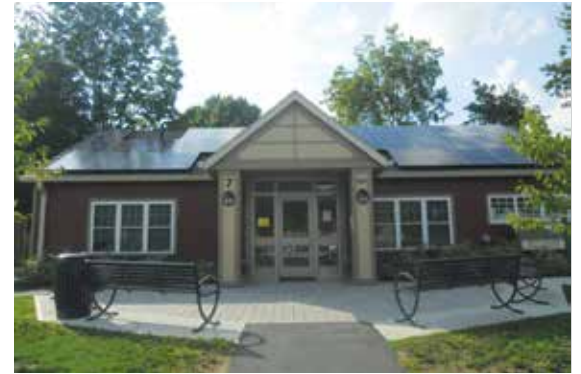
Community Building with PV