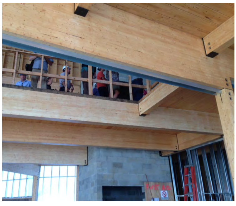
Kern Center upper structure: Nordic LAM "Glulam" timber, installed by Bensonwood of NH.

Excerpted from International Living Future Institute's Living Building Challenge SM 14 | 3.0 living-future.org/lbc