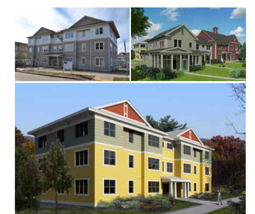
Flats West, Greek Revival Townhomes and lastly Flats East.

Our homeowners are enjoying the economic, lifestyle and comfort benefits of their Energy Star 3.0 and LEED compliant homes. With R 4.5 triple glazed windows, R 35.5 wall and R 63 ceiling insulation and an estimated HERS rating of 40 or lower, these homes remain comfortable and draft free even in the coldest of winters, as well as comfortable during summer heat and humidity. Remember, it's not so much the energy source that determines cost and sustainability – it's also very simply how much we need and use.