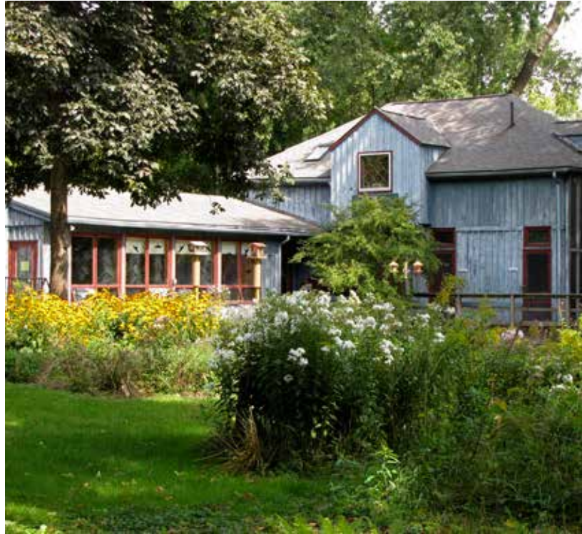
Hitchcock Center for the Environment

There are numerous ways to get involved with the community at the Hitchcock Center. As a parent, you and your family are welcome to join them for one of their children and family programs. The Center offers many educational opportunities for adults and the community. They work with student volunteers and interns as well as relying on a large network of volunteers that help them with all the work in keeping the center and its programs running smoothly. They invite you to be a part of their community in the way that works best for you.